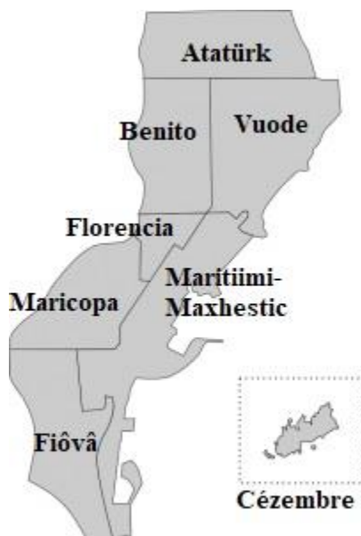
Àl sinistra: cartă dals provinçuns del Regipäts Talossan Left: map of the provinces of the Kingdom of Talossa.

Learn more: Press , Talossan Press Association